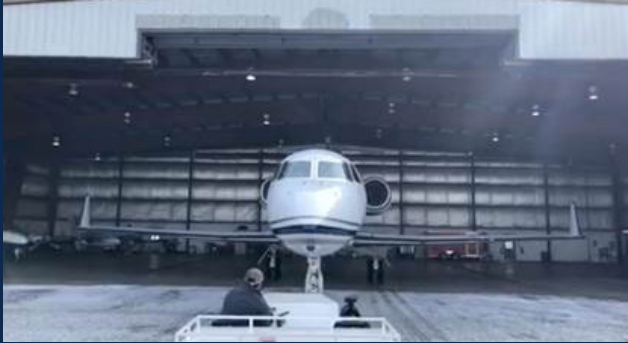
Backing in the new G IV aircraft.