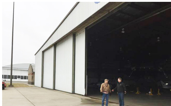
Exterior shot of existing hangar door.