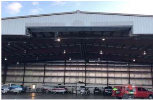
Vertical lift tail door open.