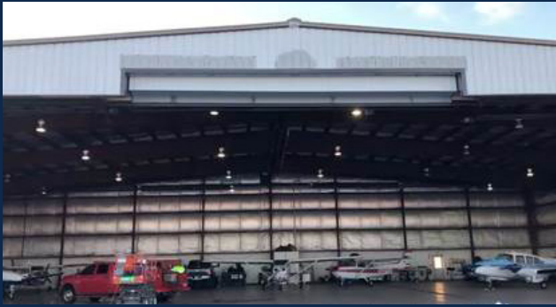
Vertical lift tail door down, bottom rolling door open.