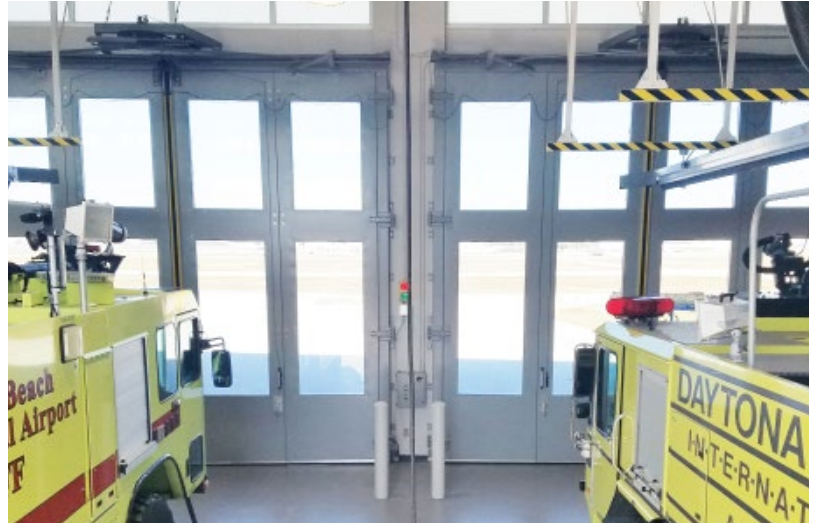
Daytona Beach International Airport.