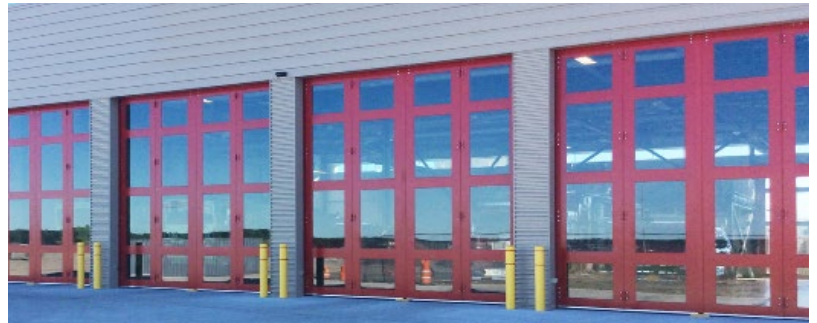
ARFF Exterior View of DE Four-Fold Doors.