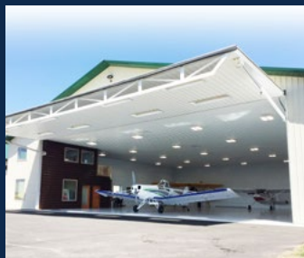
HD HYDRAULIC DOOR SYSTEMS