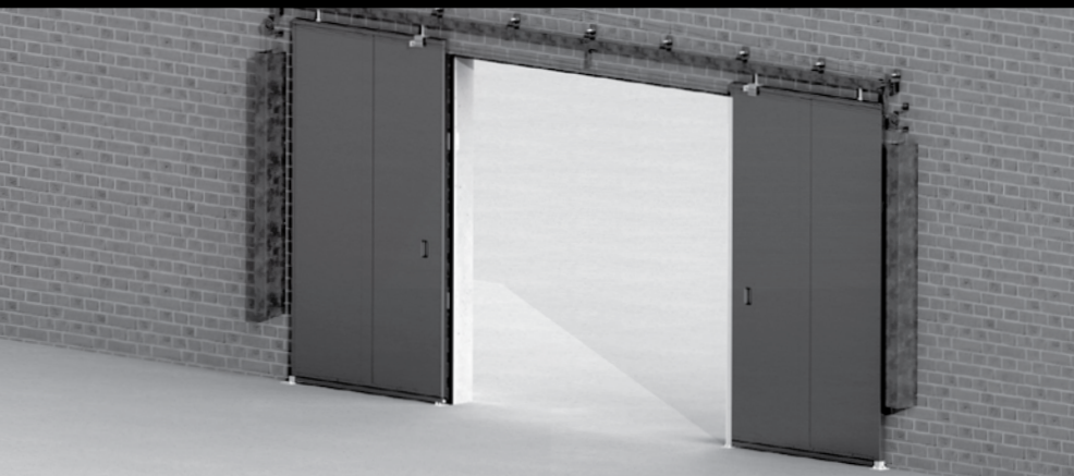
BI-PARTING SLIDING DOOR